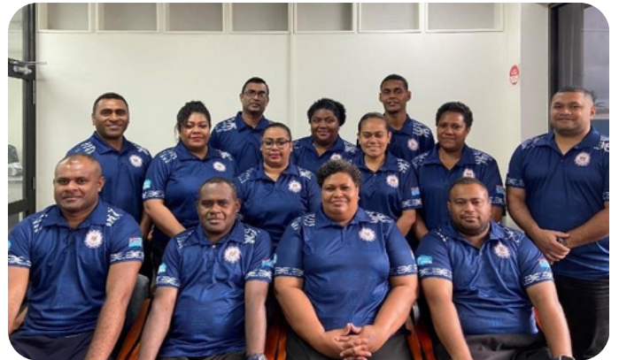
Fiji Immigration Officers in their new Polo Shirt Uniform.

In a gesture of support and solidarity, PIDC handed over sets of polo shirt uniforms to the Fiji and Samoa Immigration Offices. This will provide an alternative uniform for Immigration border management officers operating at their respective ports of entries. The donation of the polo shirt uniforms is part of PIDC's commitment to its members in enhancing border security and operational readiness.