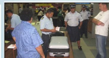
Intelligence Information within the PIDC network becomes crucial in removals or arrest of illegal immigrants moving between international jurisdictions as revealed in the 2007 Exercise Paradise in Samoa.