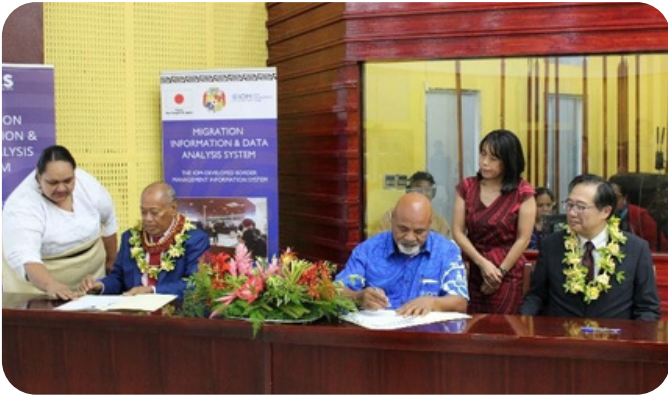
Tonga MIDAS Handover Ceremony

The Pacific is advancing border management with the successful implementation of the Migration Information and Data Analysis System (MIDAS) by the International Organization for Migration (IOM). This innovation enhances security while streamlining travel, creating a safer and more efficient border experience.