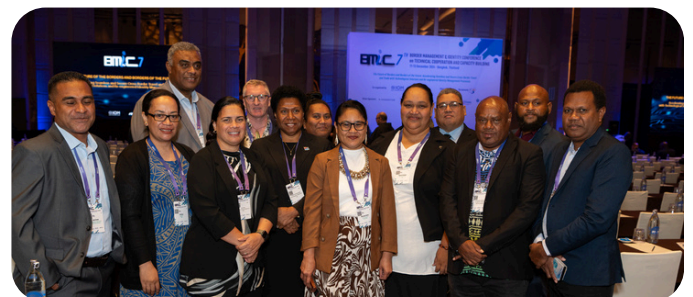
PIDC Member delegation from the Pacific