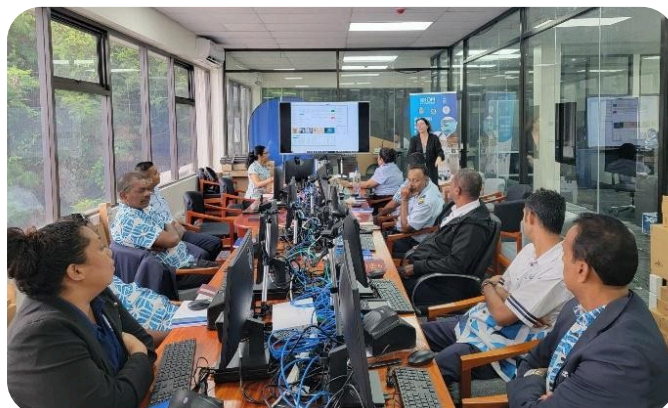
Fiji user Training

Following Tonga's success, Fiji launched its MIDAS pilot at Nausori International Airport on November 16, 2024. The Government of Fiji is currently piloting MIDAS at Nausori, operating for a one-year transition period. During this time, the Fiji Immigration Department will review its processes and prepare for full-scale deployment at Nadi International Airport and international seaports across the country. This effort builds on the recent rollout of a Visa Management System and aligns with Fiji's digital transformation goals.