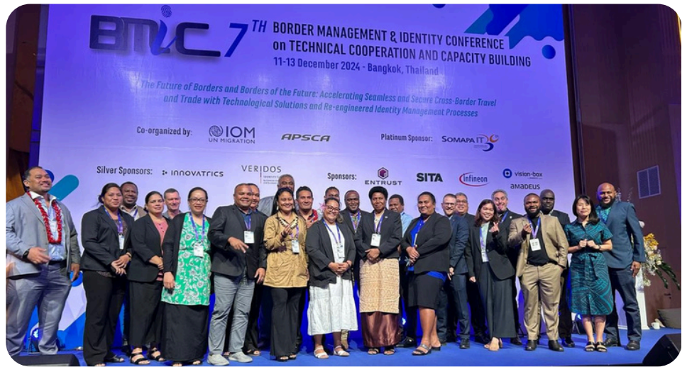
The 26 PIDC Member delegation from the Pacific attending this year's 7th BMIC in Bangkok, Thailand.

A record 26 member participants from the Pacific Immigration Development Community (PIDC) family for the first time attended the 7th Border Management and Identity Conference (BMIC) in Bangkok, Thailand from 11-13 December 2024. Hosted by the International Organization for Migration (IOM) and APSCA, the conference is Asia's largest government meeting focused on border governance and identity management.