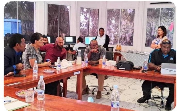
Fiji's Study Visit to Vanuatu

A delegation from the Fiji Immigration Department visited Vanuatu to see MIDAS in action, gaining valuable hands-on insights for their own implementation. Tonga's Immigration Director highlighted hopes for Tongan officers to share their expertise with other countries adopting MIDAS, reflecting the Pacific's strong commitment to mutual learning and capacity building.