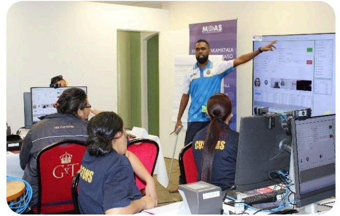
Vanuatu Officer Training in Tonga

A key feature of the MIDAS program in the Pacific is its strong focus on fostering intra-regional collaboration. Vanuatu implemented MIDAS in 2021 and has been successfully operating the system as an integral part of its border management processes. In preparation for the launch of MIDAS in Tonga, Vanuatu immigration officers co-delivered user trainings and assisted in the installation of MIDAS, alongside IOM's experts, sharing practical experiences and input with their Tongan counterparts.