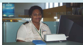
The PIDC Immigration Intelligence Bulletin provides important information in real time to frontline officers at the airport who are alerted to the arrival of unwanted visitors in a members country.

By sharing information to build better intelligence trends we can tackle fraudulent and illegal activities together. The PIDC-produced Immigration Intelligence Bulletin provides this valuable tool in the form of reliable information in real time. The Secretariat continues to work towards strengthening this intelligence network and encourages Members to continue supporting this valuable ally – The PIDC Immigration Intelligence Bulletin.