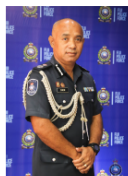
Juki Chew FONG Acting Commissioner, Fiji Police Force

The Fiji Police Force is truly excited about the ongoing work undertaken by the Project BLUE PACIFIC considering the growing threats of organized and transnational crime in our region.