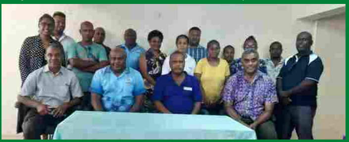
The Malaita Province Premier (centre) with national and provincial government representative stakeholders attending the Malaita Province Immigration Bill Review national consultations

Article Source: Waikori, Samie 2022, 'Consultation on Immigration Act 2021 conducted in Auki', The Island Sun, 5 October, viewed 12 October 2022, <Consultation on Immigration Act 2021 conducted in Auki - The Island Sun Daily News>