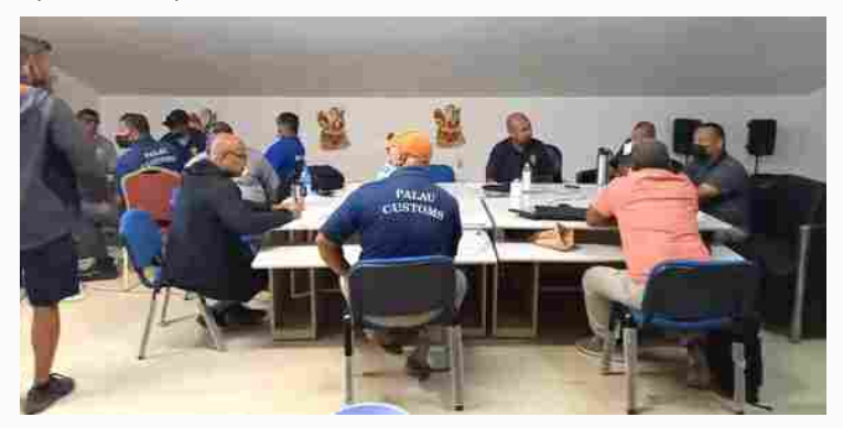
Customs, Immigration and Biosecurity Officers (CIB) in Palau met to work and discuss their strategic plan

While the strategic plans for the Republic of Marshall Islands and Tuvalu were specific to immigration, Palau's plan was more robust as it was the first strategic plan developed for the newly established Bureau of Customs and Border Protection, which brought the departments of bio-security, customs and immigration together under one agency. Palau's strategic plan was operationalized in 2022 and will be in place until 2025. The Republic of Marshall Islands and Tuvalu's plan will take effect in 2023 and be in place until 2025 and 2026 respectively. The three countries have quarterly review reporting frameworks factored in throughout the strategic plan operational period.