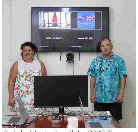
Cook Islands Immigration with their COVID-19 Communication Package