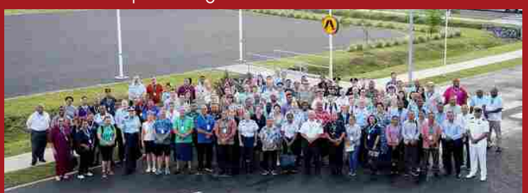
Pacific leaders at the Joint Heads of Pacific Security Meeting 2022

JHoPS22 was an opportunity for delegates to reaffirm their commitment to protecting the Pacific maritime environment.