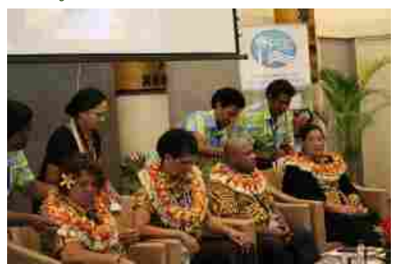
Regular Annual Meeting 2022, Nadi Fiji