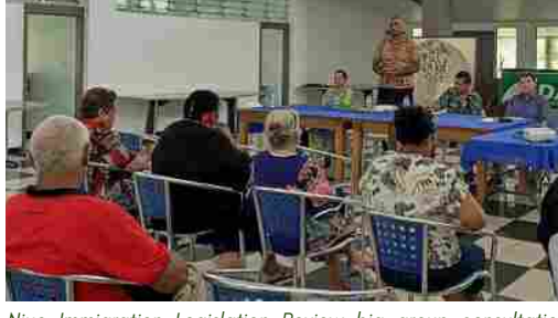
Niue Immigration Legislation Review big group consultation with the Village Councils, MPs & Churches at the old Fale Fono