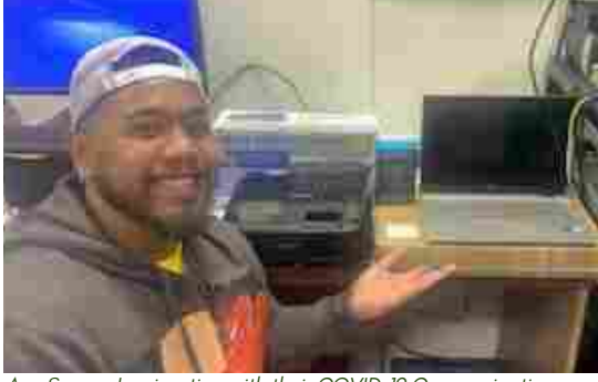
Am. Samoa Immigration with their COVID-19 Communication