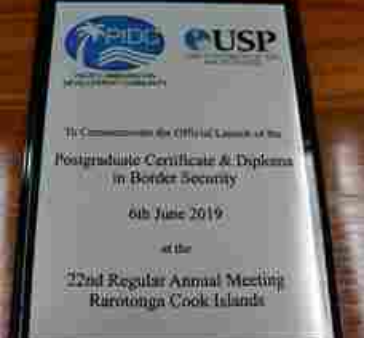
(Left) - Acting Director of Solomon Islands Immigration Office with his Postgraduate Diploma; and (Right) - USP & PIDC Official Launch of the Postgraduate Certificate Plaque in 2019