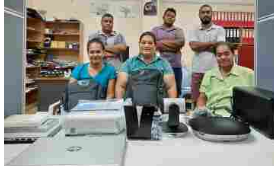
Tuvalu Immigration with their COVID-19 Communication Package