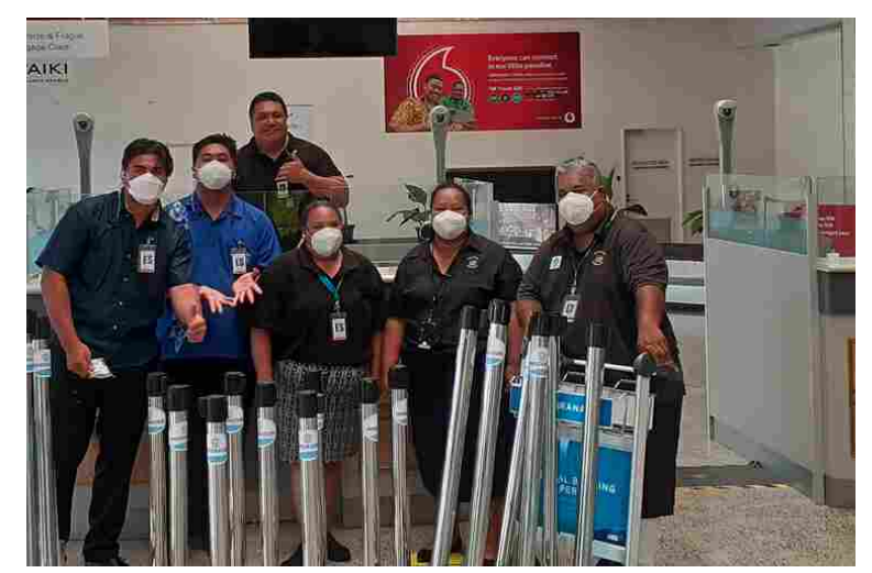
Cook Islands with their queue stations

The COVID-19 Support Programme is in its final year and continues to support Members as they slowly reopen their international borders.