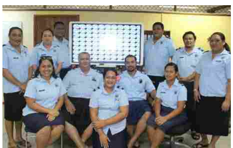
Samoa Immigration with their COVID-19 Communication Package