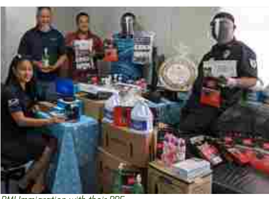
RMI Immigration with their PPE