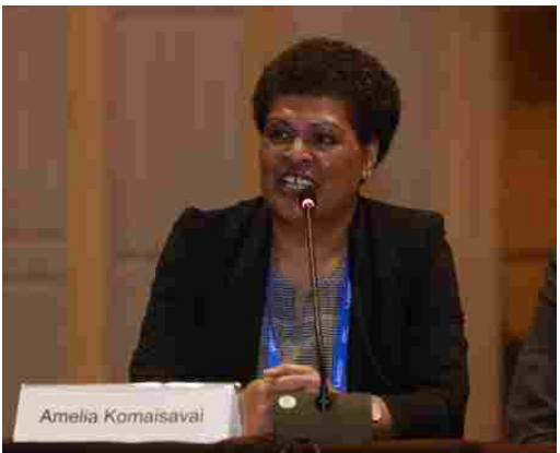
Fiji Immigration at the BMIC in Thailand