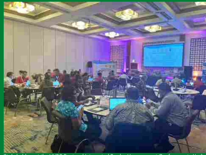
Stakeholders at the UNDP Regional Integrated Border Management Conference in Nadi

Border stakeholder representatives from Fiji, Palau and Vanuatu shared experiences of dealing with COVID-19 and other pandemic challenges and provided suggestions for a future harmonious regional approach. PIDC also shared their experience in coordinating regional support to immigration agencies during the COVID-19 pandemic.