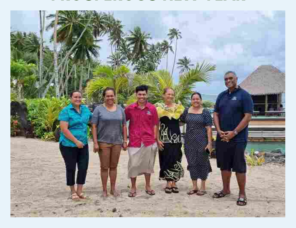
HAPPY HOLIDAYS FROM YOUR SECRETARIAT