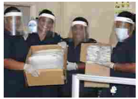
Kiribati Immigration with their PPE