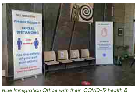
social distancing banners