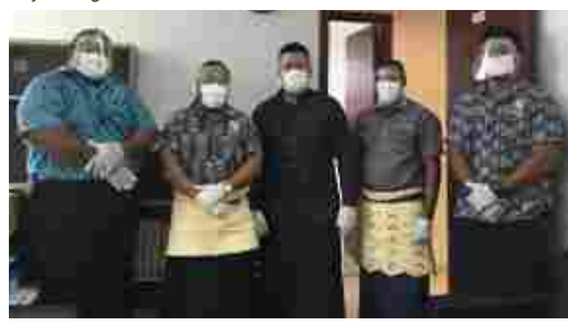
Tonga Immigration with their PPE