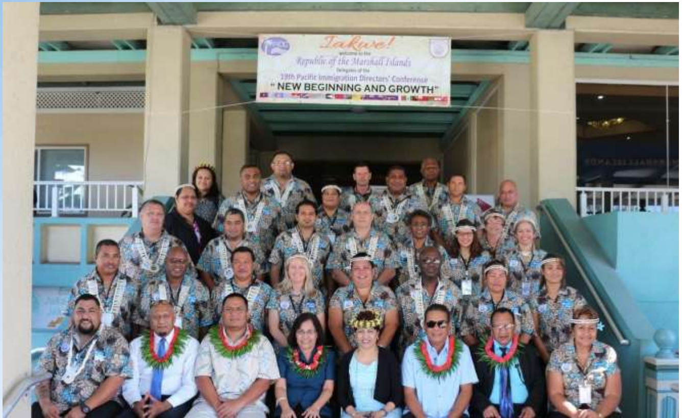
Delegates representing 17 States and Territories from across the Pacific at the 19th PIDC Regular Annual Meeting held in Majuro, Republic of the Marshall Islands from 19th to 21st July 2016.

Directors of Immigration representing 17 States and Territories from across the Pacific met for the nineteenth annual conference of the Pacific Immigration Directors' Conference (PIDC), in Majuro, Republic of the Marshall Islands from 19th to 21st July 2016.