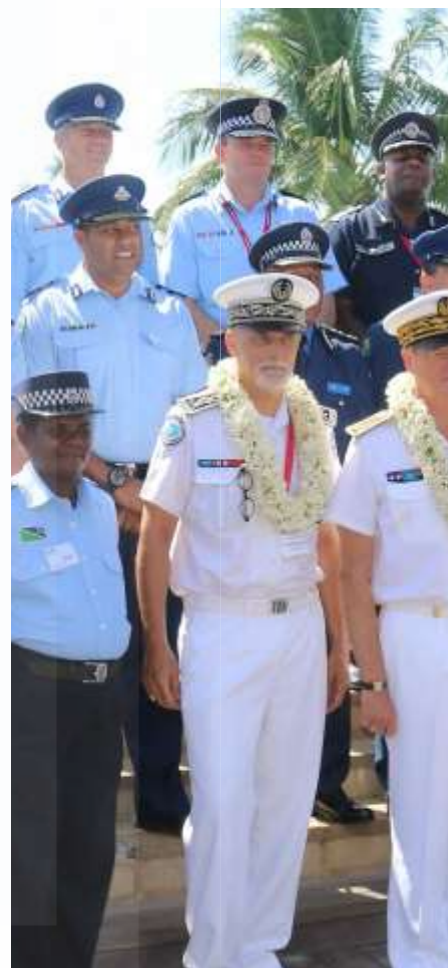
French Polynesia hosted the 45th Pacific Chiefs of Police Conference (PICP) in September 2016