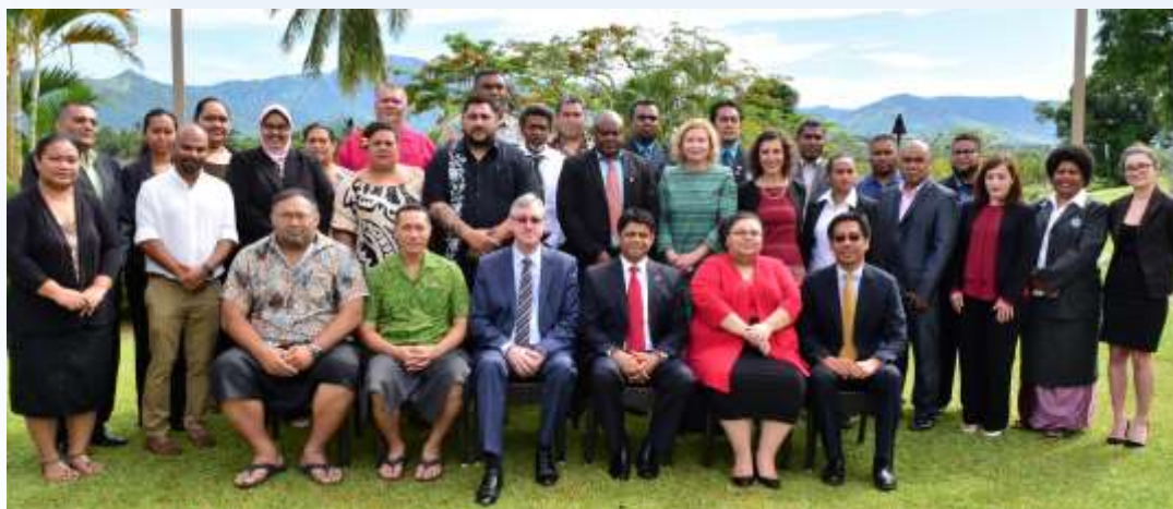
Delegates from 13 Pacific Island states participating at the Pacific Regional Protection meeting that was hosted in Fiji. (Photo source: UNHCR)

UNHCR and the Government of Fiji jointly hosted the Pacific Regional Protection Meeting on 29-30 November 2016 in Nadi, Fiji, with support of the Pacific Immigration Directors Conference (PIDC). The two-day conference was attended by 30 senior officials, heads of immigration departments and ministry representatives from 13 Pacific Island countries, the Secretariat of the PIDC and observers from the Fiji Legal Aid Commission, Fiji Human Rights and Anti-Discrimination Commission and UNDP. The conference provided an opportunity for representatives of Fiji, the Cook Islands, Federated States of Micronesia, Kiribati, the Marshall Islands, Nauru, Palau, Papua New Guinea, Samoa, Solomon Islands, Tonga, Tuvalu and Vanuatu to exchange lessons learned and good practices, and to identify key actions necessary to effectively support persons in need of international protection throughout the Pacific. The delegates considered international and local developments relating to mixed migration, refugee protection, statelessness, and climate-induced displacement in the meeting and how these impact on Pacific Island states, with a view to enhanced regional and sub-regional innovation and cooperation. (Source: UNHCR)