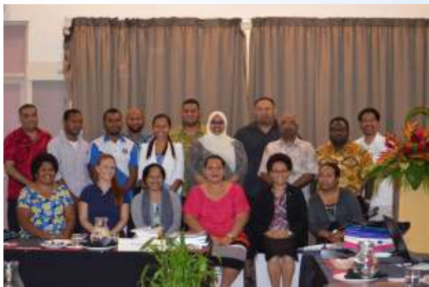
Participants from Fiji, Samoa, Vanuatu, Palau, Federated States of Micronesia and Solomon Islands participating in the UNHCR workshop.

In 2016, the Pacific Protection Learning Programme was launched to assist Pacific Island Countries to develop protection-sensitive and sustainable responses to forced migration and statelessness. Participants from Fiji, Samoa, Vanuatu, Palau, Federated States of Micronesia and Solomon Islands