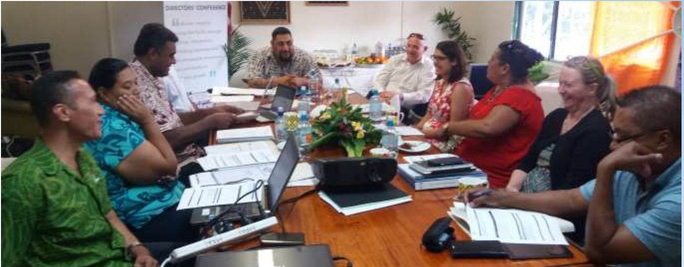
Board members in discussion at the recent Board meeting that was hosted by the Cook Islands Ministry of Foreign Affairs and Immigration at their department Board room in Rarotonga.

The Pacific Immigration Directors' Conference (PIDC) Board met in Rarotonga from 17 to 19 October 2016. As the Board's first meeting since the PIDC Secretariat's relocation from Fiji to Samoa in August 2016, the pri-