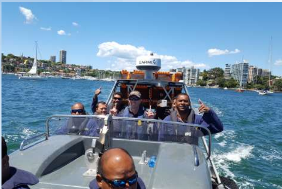
Vessel search participants head out to sea.

The Australian Border Force hosted an “International Craft Search Course” in Sydney from 05-09 December 2016 which was attended by 5 immigration officers from the Federated States of Micronesia, French Polynesia, Kiribati, Samoa and Tonga. This was the first time that immigration officers from the Pacific participated in the international pleasure craft search course. The inclusion of the immigration officers was supported by the Pacific Immigration Directors Conference (PIDC) as it provided immigration officers an opportunity to learn the investigative techniques of customs led vessel searches in addition to networking amongst participants. The officers agreed that the highly intensive training course enabled officers to acquire new investigative skills and techniques and highlighted the need for coordinated planning and officer safety. Participant immigration officers highly recommended continued participation of other immigration departments for any future training opportunities.