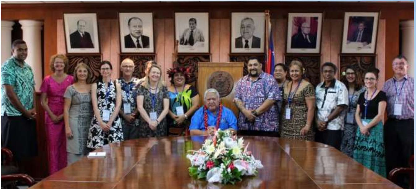
Signing of the Headquarters Agreement between the Government of Samoa and the PIDC Board

The Conference also adopted a change of name from the initial “South Pacific Immigration Directors” (SPID) Conference to “Pacific Immigration Directors Conference”. This change in name was made to broaden its membership to include other Independent territories and states in the Pacific.