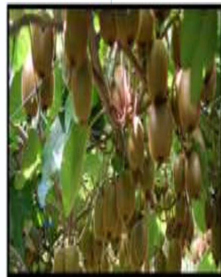
Migrant workers from Fiji were allegedly trafficked to work in the kiwi fruit and construction industries in New Zealand.