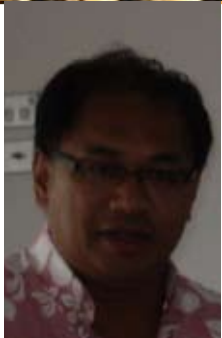
Head of Cook Islands Immigration, Kave Ringi

have stated their strong support for future meetings of the Board.