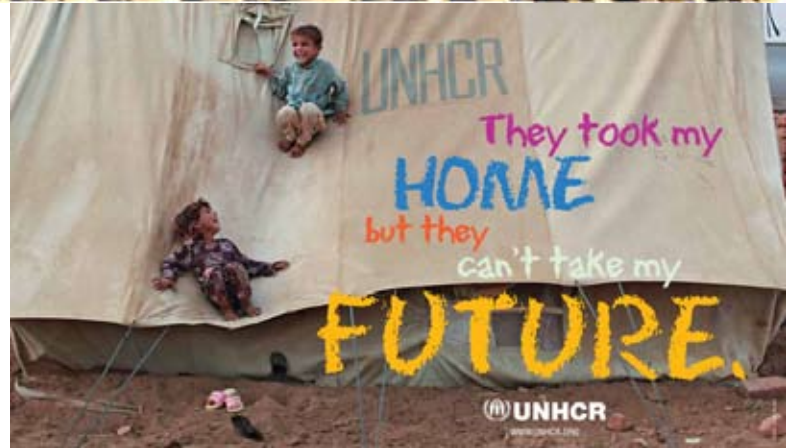
2010 WRDay poster

The report shows that one out of four refugees in the world is from Afghanistan, with 2.9 million - most of whom are hosted in Pakistan and the Islamic Republic of Iran.