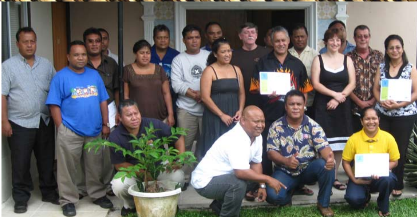
Micronesian region course participants take time out for a group photo.