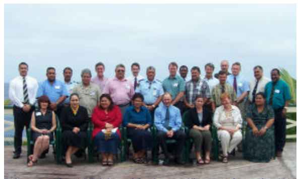
Delegates to the 6 th PIDC Annual Conference, Niue 17-19 September 2002

As a result of discussions during the conference an Advisory Committee was established to progress issues between conferences and to provide direction and guidance to the Secretariat on behalf of the PIDC membership. The committee comprises of Australia, Cook Islands (to be confirmed), Niue, PNG, Tonga and Fiji.