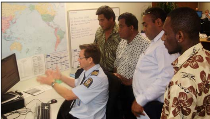
A New Zealand Customs Officer explaining how their information exchange system operates to course participants.

This was in addition to how intelligence alerts were exchanged between agencies in ensuring that their borders were secure from criminal