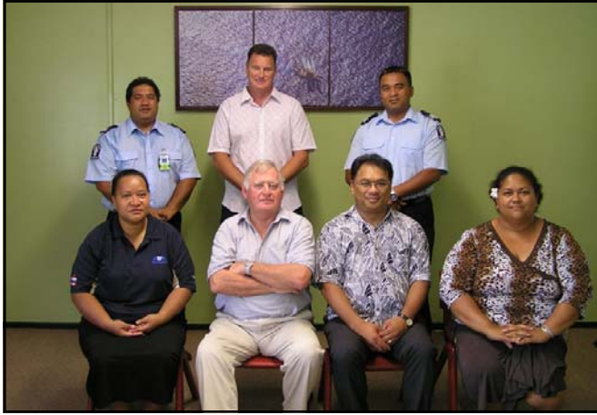
Dean (middle at the back) with the Cook Islands Immigration staff during one of his visit to the Cook Islands

ties. Within Immigration NZ, projects have included training of Pacific-based visa and verification