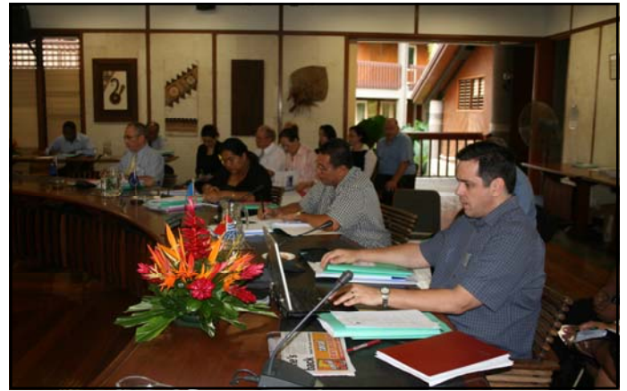
Delegates in a session at the 2009 FRSC that was held at the Pacific Island Forum Secretariat in Fiji.

The Pacific Islands Forum Secretariat recently concluded the 2009 Forum Regional Security Committee meeting. At the meeting the Forum Secretariat Law Enforcement Unit (LEU) tabled the 2009 Pacific Transnational Crime Assessment. This assessment is developed in cooperation with specialist regional law enforcement agencies and Secretariats, including the PIDC, and highlights ongoing transnational criminal activity in the Pacific region.