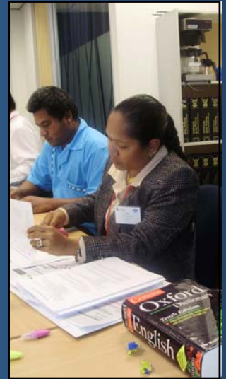
Lolyna from Palau Immigration taking notes during the first intelligence course