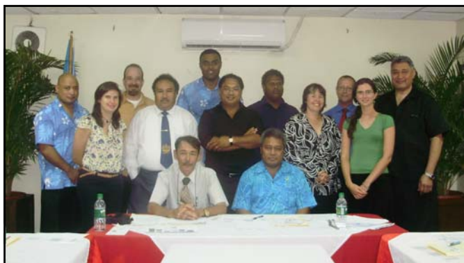
PIDC Management Board members attending the first board meeting for 2009 in Palau.

Its past and present plans has guided the organisation successfully while the recommendations from this years institutional review is intended to carry the organisation sustainably into the future as we build on the successful platform that has been achieved.