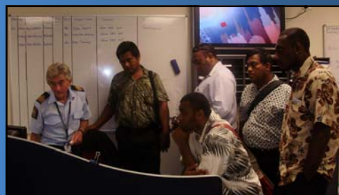
Intelligence course participants listen attentively to a briefing on NZ customs intelligence work.