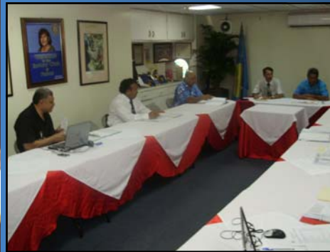
Members in discussion during the first Board meeting that was recently held in Palau.