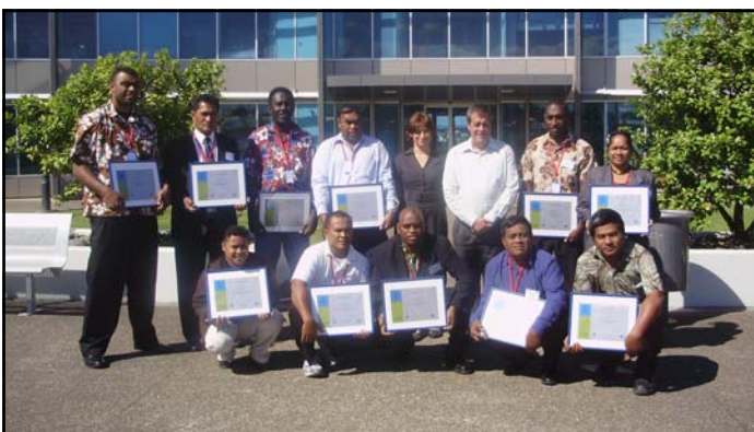
Participants with their training certificates at the completion of the joint intelligence officer training that was recently held in Auckland, NZ.

Immigration New Zealand (INZ) and the New Zealand Customs Service (NZCS) hosted the first intelligence Officer training programme for