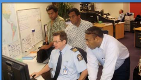
Intelligence course participants listen attentively to Customs Officers on a guided tour of the NZ National Targeting Center