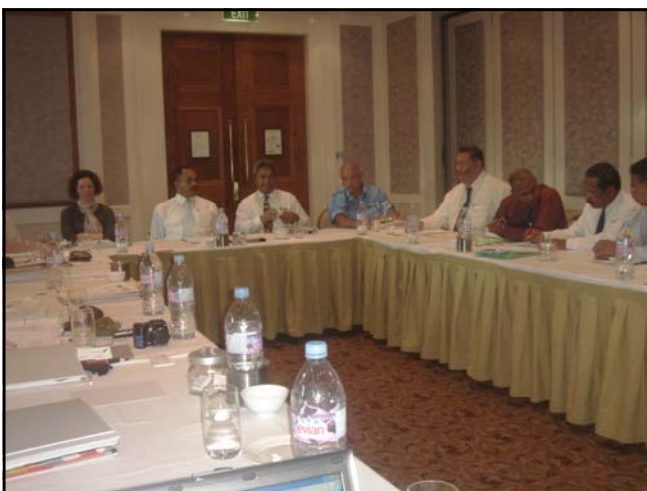
The Strategic Review Working Group meeting in session during its first meeting in Brisbane.

To assist the Working Group's discussions the secretariat undertook a survey of members' assessment of the strategic plan 2005-08. An assessment report was produced which was drawn from issues highlighted by members in their submissions through the PIDC Strategic Plan survey, in addition to views raised through the 2007 Annual Collection Plan and the 2007 Country Reports. The issues raised in the report became a crucial point of reference drawing the Working Groups attention to the priorities and challenges of the PIDC.