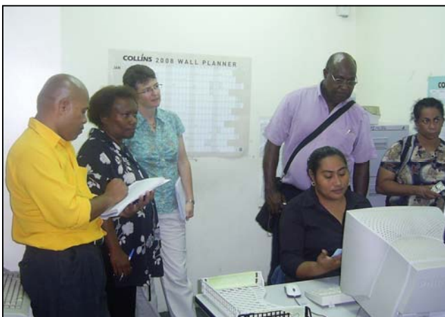
PNG and Vanuatu Immigration officials studying the Samoa Border Management System at the Samoa Immigration Head quarters.

The visit also proved to be an excellent opportunity to promote regional cooperation between agencies and to discuss areas of mutual interest such as improved border security and improved governance and planning within Immigration agencies. Vanuatu had indicated in their report to PIDC in 2007 that such a visit was desirable.