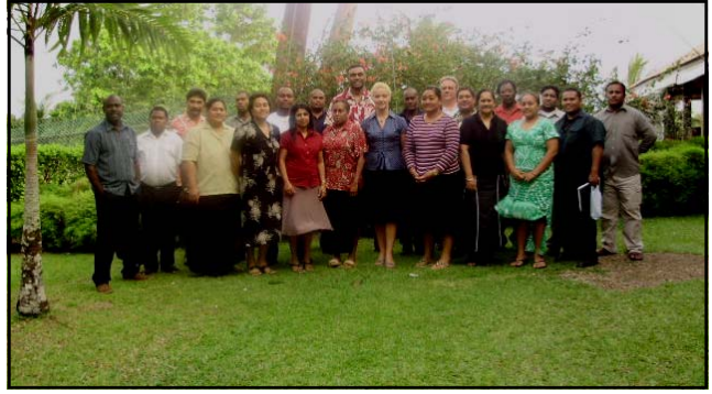
Participants at the Advanced document examination training in Vanuatu.

The course was attended by 17 Immigration Officers from the Cook Islands, Fiji, Kiribati, Marshal Islands, Nauru, New Zealand, Palau, Samoa, Solomon Islands, Tonga, Tuvalu, Vanuatu and a PIDC Secretariat staff. The course trained Immigration Officers on key document examination elements relating to characteristics of inadmissible travellers: systems, trends, intelligence, intuitive assessment and questioning