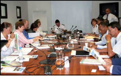
PIDC Management Board meeting in Noumea