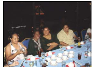
Graduation dinner for document examination participants in Vanuatu.