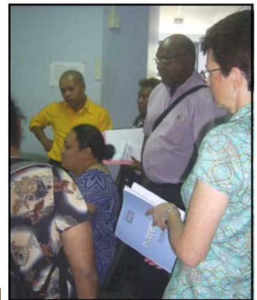
PNG and Vanuatu Immigration Officers studying the Samoa Border Management System.