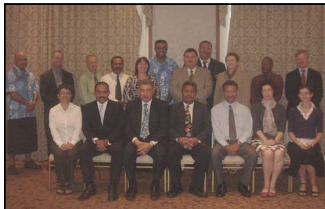
Members of the Strategic Plan Review Working Group.

PIDC has grown over the years and with its new responsibilities has been taken on board by the organisation. Its strategic plan for the last 3 year period (2005-08) has guided the organisation successfully while the new strategic plan 2009-12 is intended to carry the organisation forward from the successful platform it has achieved.