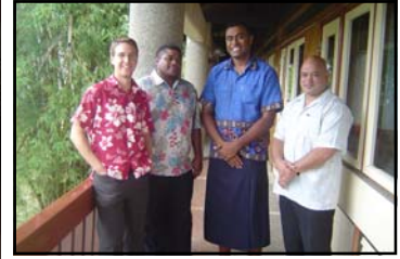
The PIDC Secretariat Staff