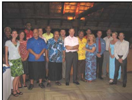
PIDC Management Board members at a cocktail reception hosted by the French High Commissioner in New Caledonia.