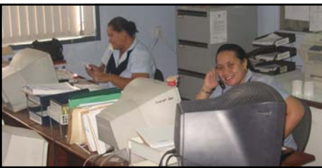
Samoa Immigration Officers busy at work.