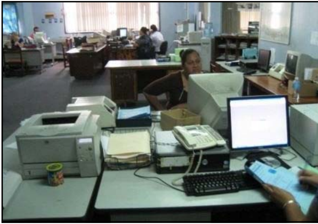
Samoa Immigration Officers workstations in Apia are all connected to the BMS. Samoa's BMS integrates Samoa Border Control agencies (Customs, TCU, Police, Quarantine and Justice Department) into a single information system.

This was an excellent opportunity for PICs to share experiences of change management processes. Importantly, Samoan Immigration stressed the importance of mutual cooperation and commitment through the bilateral relationship to both fully resourcing and sustaining the Border Management System (BMS). Samoan Immigration also noted the importance of ensuring on-going domestic commitment to the change management process, particularly through an emphasis on training, systems support and resourcing an IT Unit within the Immigration Department.