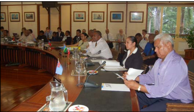
Delegates in discussion at the FRSC in Suva, Fiji.

A joint report on future trends of transnational organised crime in the region and a Pacific Transnational Crime Assessment incorporating regional strategic advice and recommendations was prepared by PIFS, PIFFA, OCO, PIDC and the PICP Secretariat was presented at the meeting. The report also included PIDCs' 2007 People Smuggling, Human trafficking and Illegal Migration Report. In addition the Secretariat was also given the opportunity to further update participants on its regional activities in the post 2007 FRSC period. The presentation was well received by participants with members of the meeting noting the role and activities of the PIDC in regional and security matters. Members also encouraged PIDC to continue progressing outcomes of the 11 th Pacific Immigration Directors Conference.