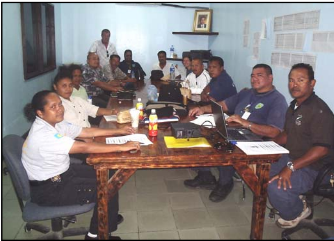
The Palau national inter-agency teamwork in one of its meetings following the signing of the cooperative agreement..

the New Zealand government. The overarching purpose of the PRIIP is to build capability to detect, prevent, investigate, prosecute, measure, and respond to identity crime. Palau is the first pilot country to participate, with others including Samoa, Cook Islands, Papua New Guinea and Kiribati. Palau will act as a mentor to neighbouring countries e.g. Marshall Islands, Northern Marianas and FSM. As an example of inter-agency co-operation, a trainer from the Bureau of Immigration, Division of Customs and Bureau of Public Safety have developed and started to deliver a training package on identity crime awareness including types of identity crime, examples from Palau, and how to protect oneself. The development of the training is ongoing and further training sessions will be delivered to government agencies, private sector and the public.